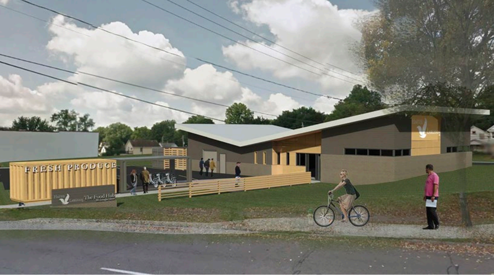
Architect's rendering of Hattie's Food Hub opening this spring on Douglas Street in Akron.