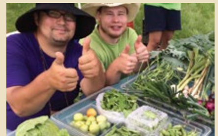
Opening this spring, Hattie's Food Hub brings fresh, local and affordable produce to Akron.