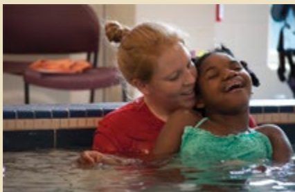
A 48-hour Flash Fund on March 21 and 22 will raise money for aquatic therapy equipment.