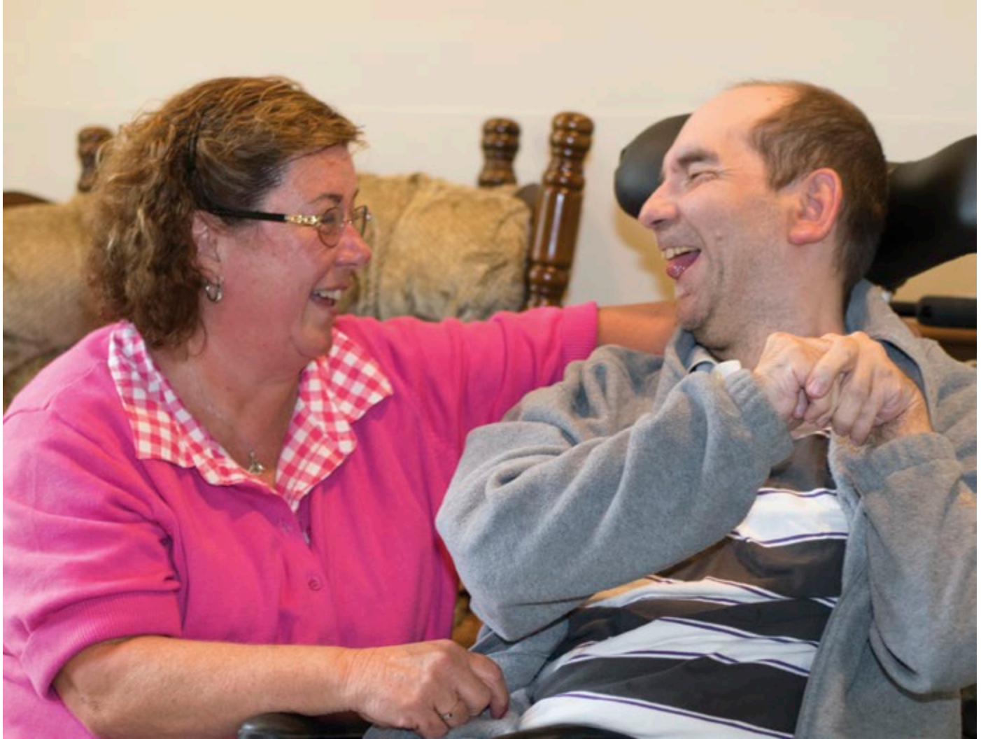
Celebrating, from page 1

We explore innovative ways to develop work-training opportunities that foster independence and teach the technical, social and emotional skills adults with disabilities need to obtain competitive community employment. Now open, Hattie's Food Hub provides more than just work experience. It is an opportunity for people with disabilities to be part of a healthy eating movement in Akron.